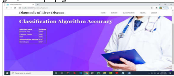
Fig. 1.2 -Classification reports